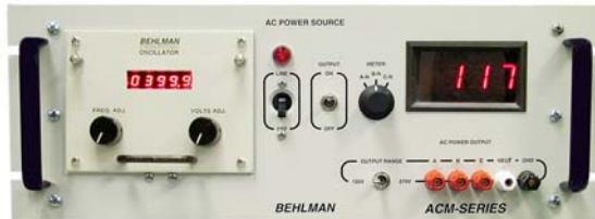
ACM-250 with OSN-1-45/2500